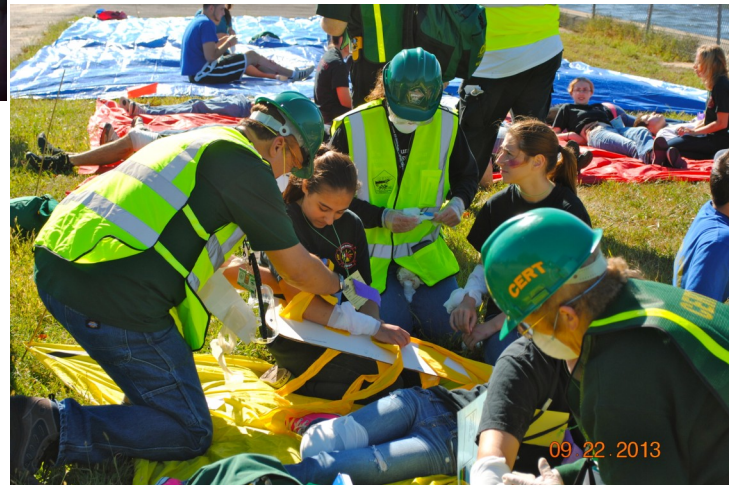
Youths from a number of organizations supported this exercise, posing as "victims"

Because of the efforts of volunteer CERT, ARES, ARC members, Scouts, Fire Departments, and so many other outstanding volunteers who participated, contributed, taught, learned, and tested the strengths and weaknesses of our emergency response plans, we are now better prepared to assist all of our communities in times of need. Thank you, and congratulations to all, and for a job well done!