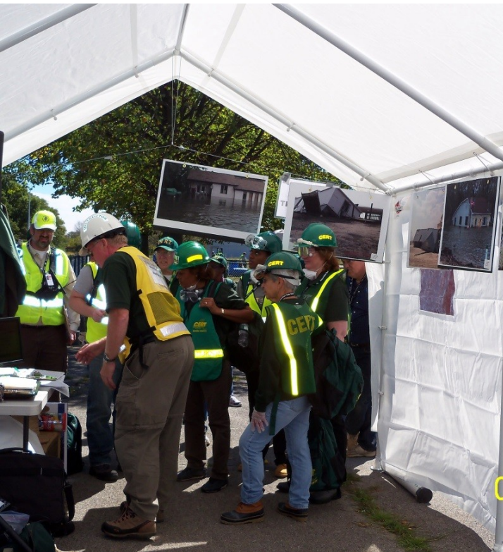
Disaster Assessment Station

and Scenario introduction as well as a Safety Briefing . Those who were assigned to operate an FRS radio also received a Communications Briefing . The teams received further briefings at each Training Station that were more specific to that Station's scenario and function.