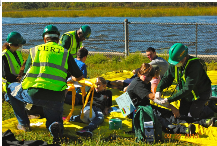
CERT Members Apply Emergency First Aid to "Victims"

Disaster Medical Operations consisted of three stations developed and staffed by Suffolk County CERT members, that focused on Triage and Emergency First Aid to victims requiring transportation. A large number of "victims" exhibiting a variety of symptoms and obvious wounds were role-played by youth members of Scout and Venturing units, Fire Department Juniors, and members of the N.Y. Grey Cadets. The simulated wounds were applied (and removed) by the Nassau County CERT Moulage Unit.