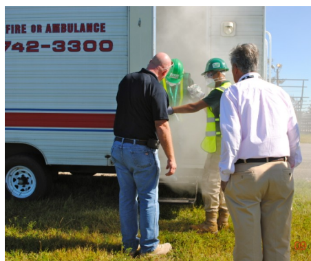
CERT members exit the Smoke House trailer in a cloud of smoke

CERTs were deployed to the Smoke House trailer to learn the proper method of escape during a fire. The Smoke House simulation illustrates another