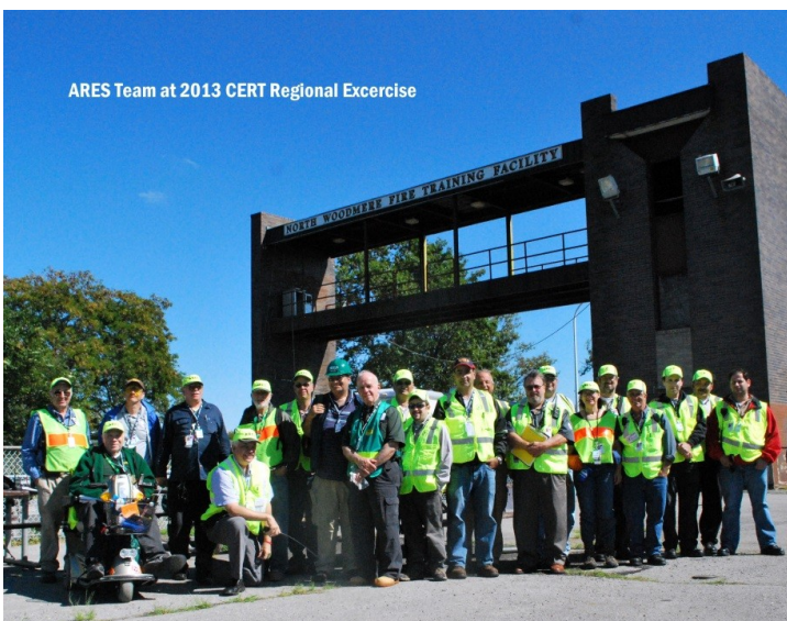
ARES Team Members at 2013 CERT Regional Exercise

Our CERT members followed the standard protocol of responding to the exercise and reporting directly to the Staging Area, where they were briefed, formed into teams, and deployed. The CERTs received a Welcome