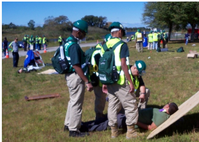
Obstacle Course Station

their counterparts from New York City and Suffolk County.