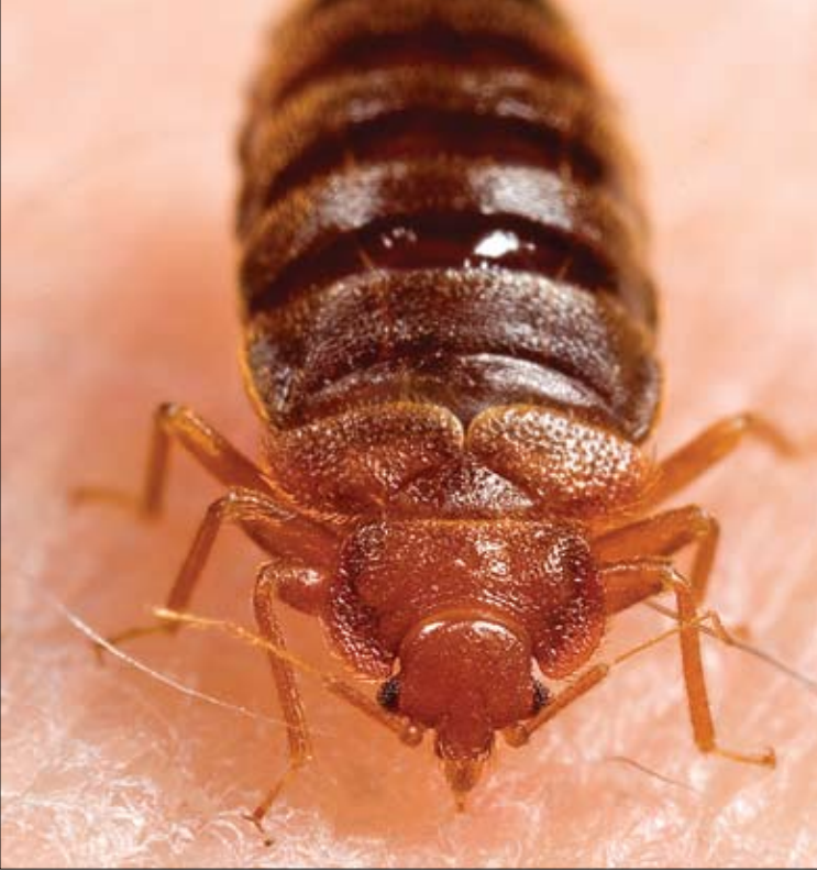
An adult bed bug, Cimex lectularius , ingesting a blood meal from a human host.

to take advantage of tools that can aid in early detection and eradication of bed bugs. Any measure that helps the employee at home will in turn help reduce the likelihood of reintroduction of bed bugs into the workplace.