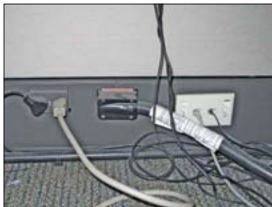
Cubicle dividers that are rich with technology and office clutter can present significant obstacles to a successful bed bug treatment.