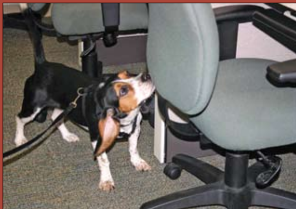
Brody, a bed bug dog, inspects an office chair.

It may seem that using multiple dog/handler teams would be cost prohibitive, but in many cases the