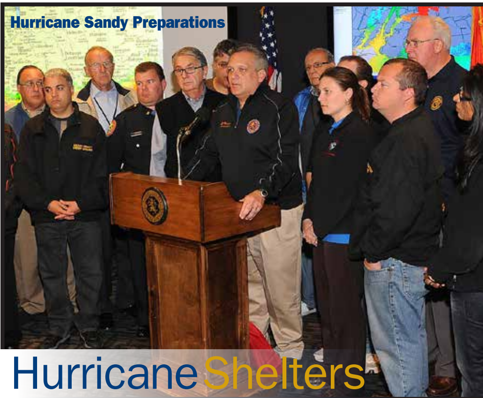
Hurricane Sandy Preparations