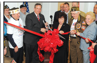
VA Clinic in Nassau County now open. NUMC Building Q at 2201 Hempstead Turnpike in East Meadow.