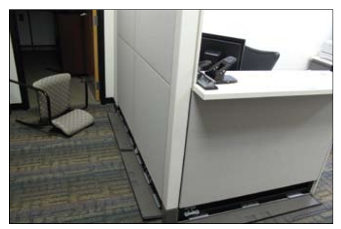
An office cubicle that has been prepped for a bed bug treatment.

and along cove moldings at the room perimeter. We have also seen evidence that they travel inside subfloor conduit runs. Bed bugs also move around the office and to other floors within a building...or even to other buildings occupied by the same company... hitchhiking on files, boxes, and personal items.