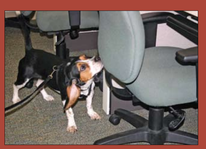
Brody, a bed bug dog, inspects an office chair.

It may seem that using multiple dog/handler teams would be cost prohibitive, but in many cases the