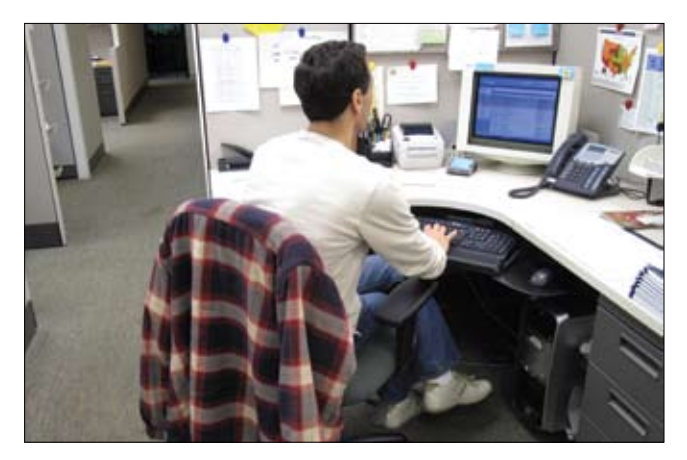
Worker-related issues, such as morale, pesticide concerns and cooperation, must be addressed.

Bed bugs disperse into other areas. Bed bugs disperse in two ways: walking or hitchhiking. It's hard to determine which is more important in offices. Our work with bed bug detection dogs suggests that bed bugs often travel in straight lines following aisles made by the base of cubicle dividers