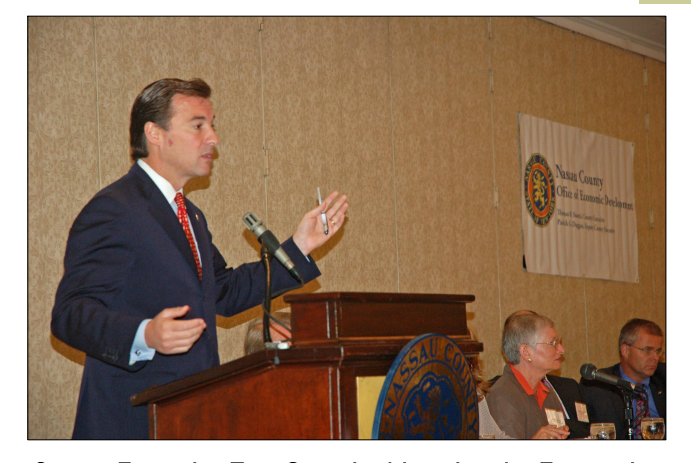
County Executive Tom Suozzi addressing the Economic Development Summit on Sept 7, 2006

Classes and workshops in a wide variety of areas were offered including Green Building, Best Practices and Smart Growth. There was also an all day Legal Forum sponsored by Boston College. The staff attended workshops in the Beginner, Intermediate and Advanced track.